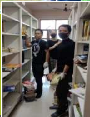
Jt. Director College's Visit