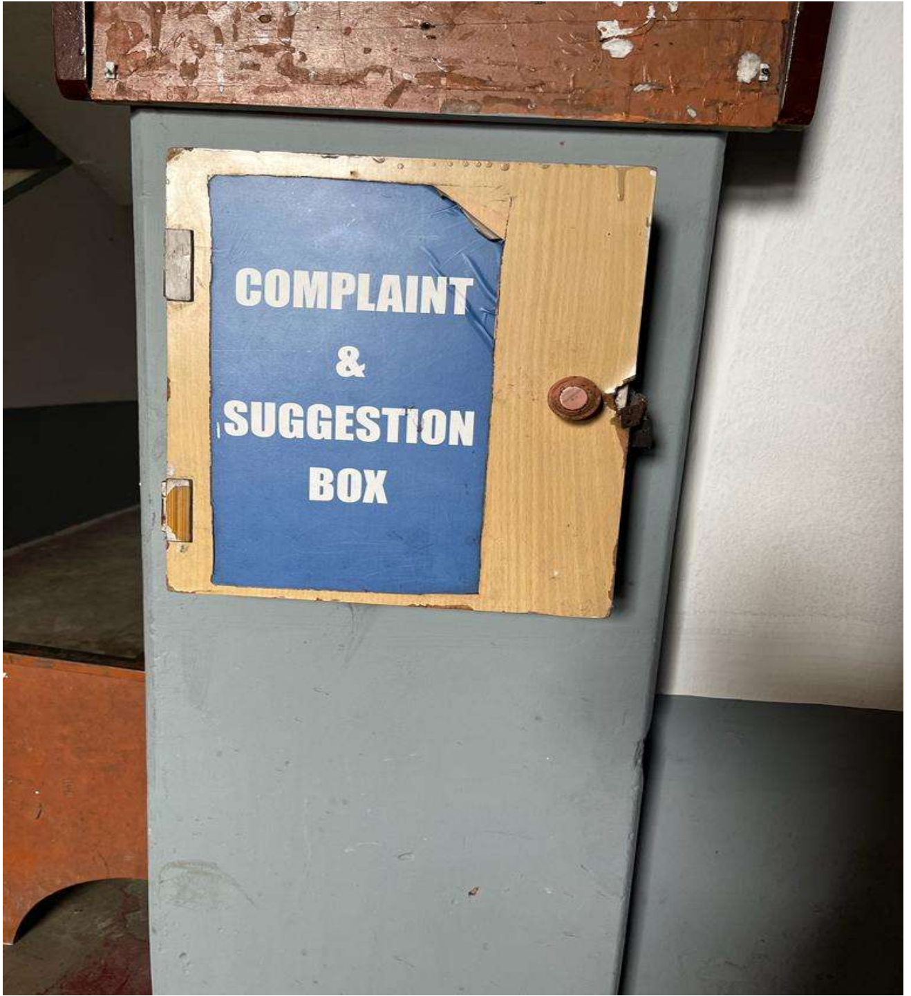
Drop Box near Classroom