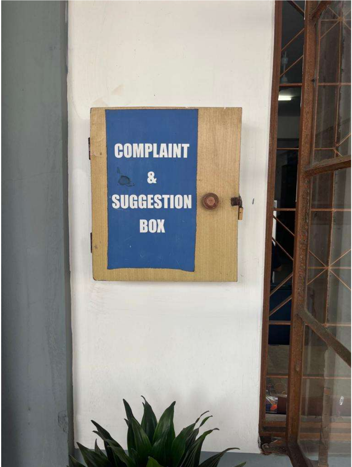
Drop Box near the office