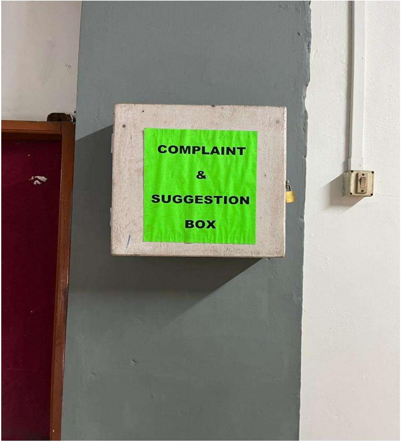
Drop Box near Teachers' Common Room