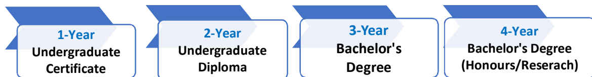
Figure 1: Multiple Exit Options

The UG Programme will be of Three-Year (Bachelor's Degree) or Four-Year (Honours/Research) duration and the curriculum will be flexible by allowing creative combinations of subjects where vocational education will be an integral part. The students will have opportunity for multiple entry and exit with appropriate certification viz. Undergraduate Certificate after one year (two semesters), Undergraduate Diploma after two years (four semesters), Bachelor's Degree after three years (six semesters) and Bachelor's Degree with Honours/Research after 4 years (eight semesters) ( Fig. 1 ). This will allow them to continue or leave a course as per their convenience/passion.