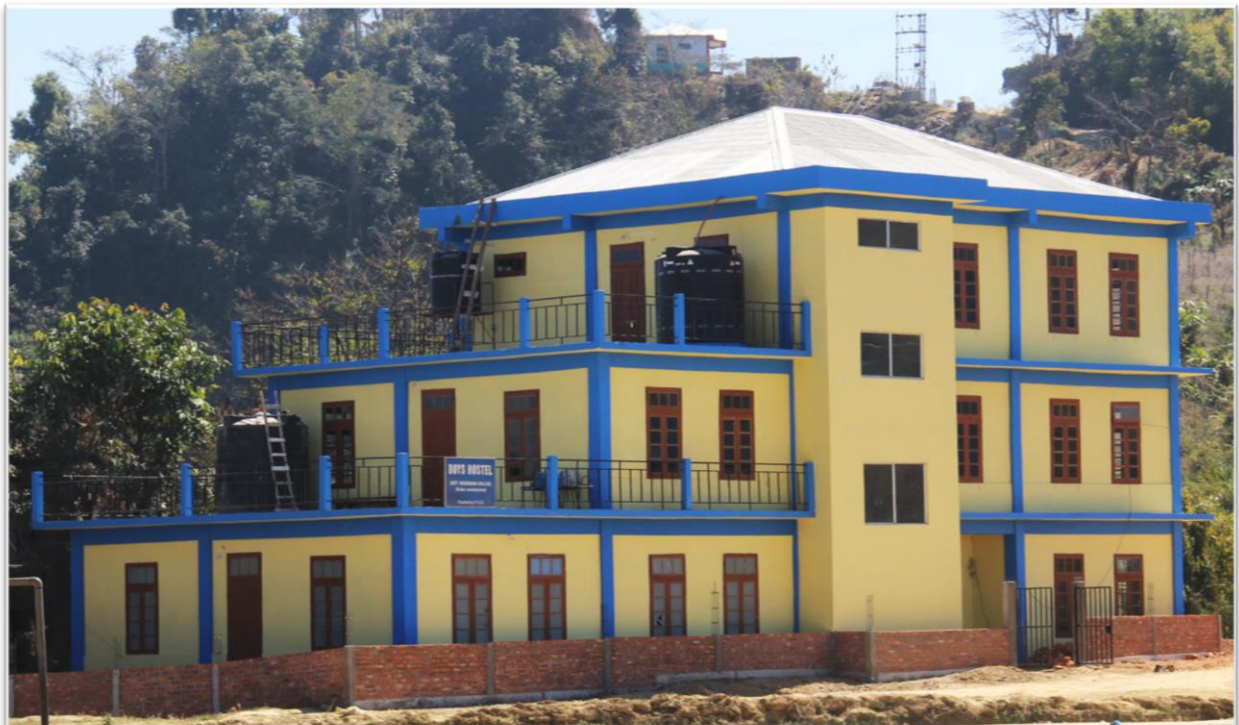
Boys Hostel, Muthi