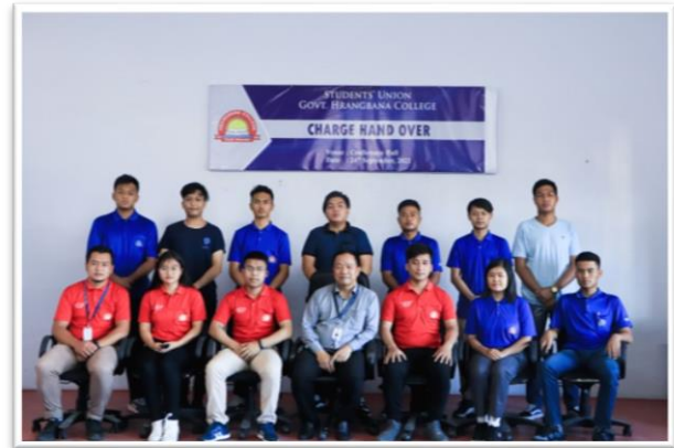
Students' Union Leaders 2021-22