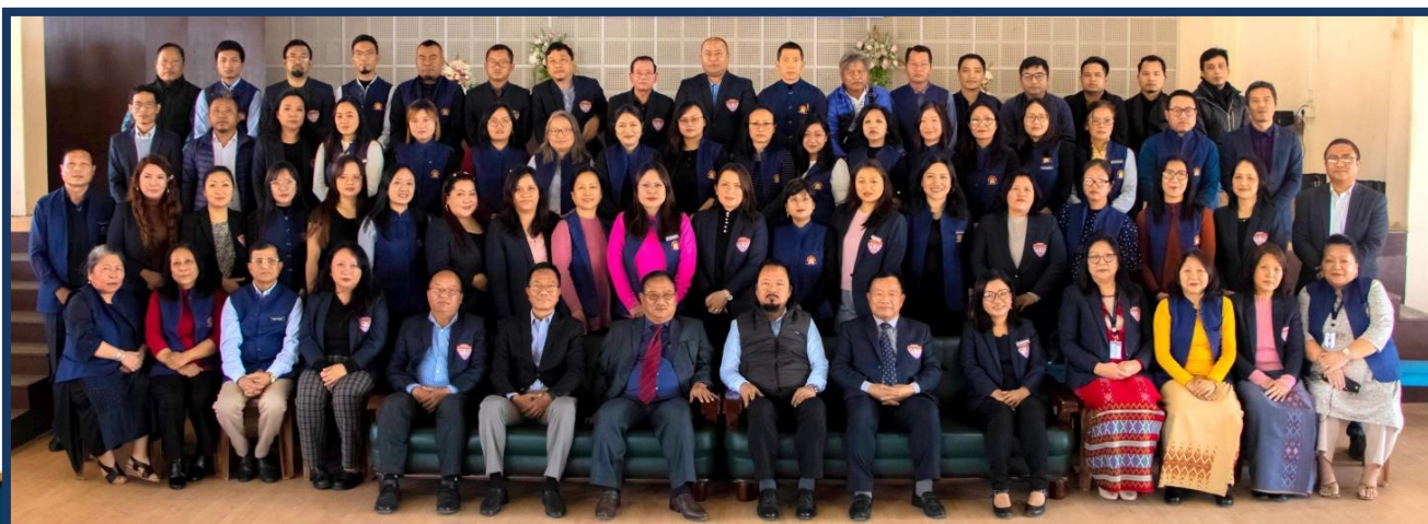
Teaching Faculty & AAA Assessors