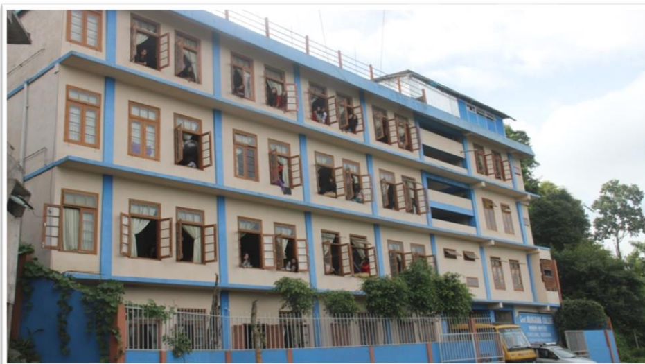
GIRLS HOSTEL, DURTLANG

(Details can be seen from the college website)