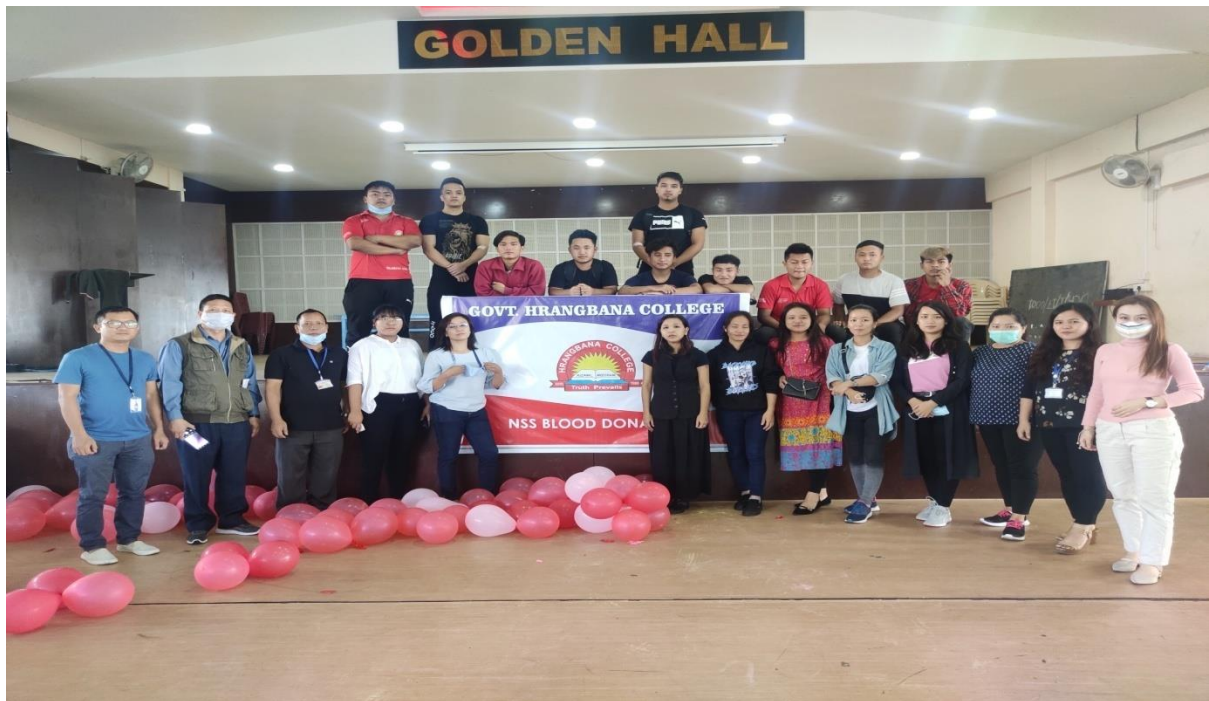
Blood Donation Camp Dt 20 th October 2020 at College Golden Hall