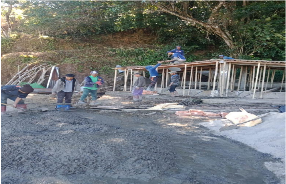
Special Camping at Sailam Dt 23 rd – 29 th March, 2021