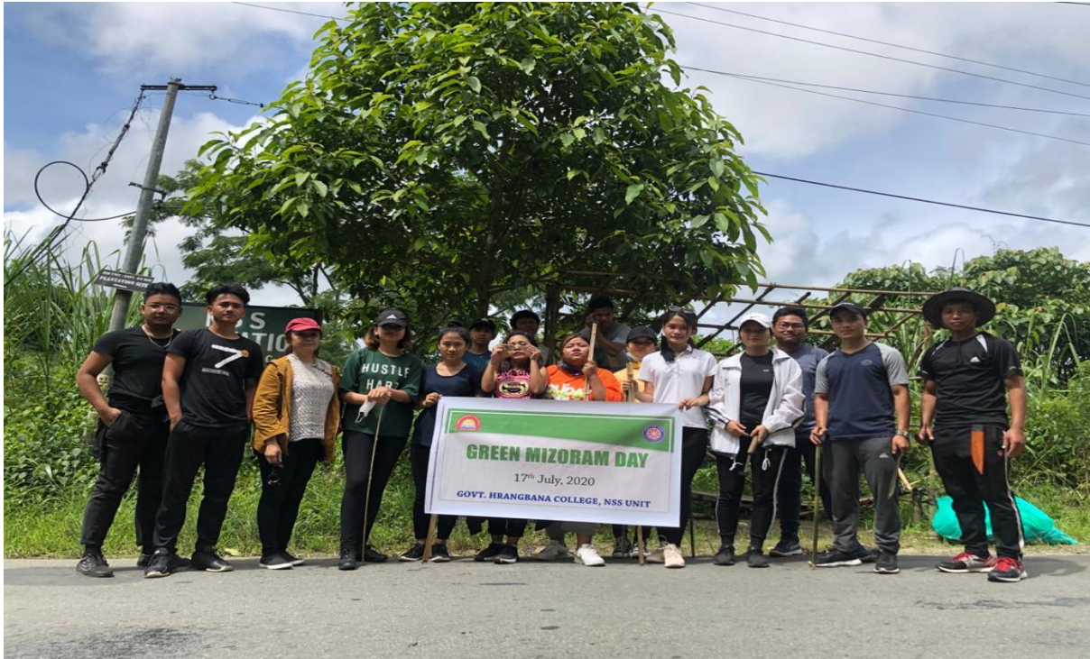
Green Mizoram Day cum Tree Plantation Programme was observed at our plantation site Thiak, Hmuifang Road, Dt 17 th July, 2020