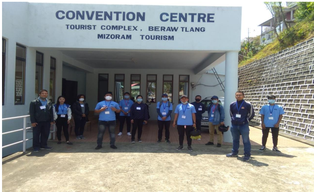
NSS Voluntary Duty at Berawtlang: From 2 nd to 14 th April 2020