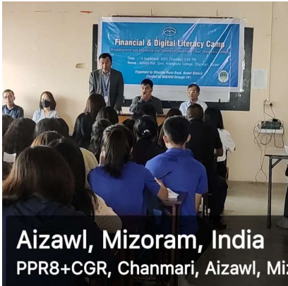
Aizawl, Mizoram, India PPR8+CGR, Chanmari, Aizawl, Miz

A seminar on Financial & Digital Literacy Camp was held on the 13 th September, 2022 at the College premises. The programme was organized by Mizoram Rural Bank, Aizawl Branch, in Collaboration with Department of Economics and Department of Commerce, Govt. Hrangbana College. In this seminar, students were sensitized about the various opportunities available in banking sector, the importance of digital transactions, various financial products and security schemes available etc. Students were also given on the spot opportunity to open Saving Account.