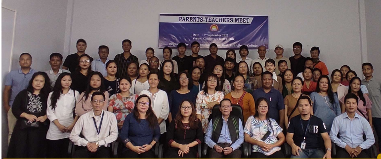
Department of Mizo

Parent -Teacher Meeting in the current academic year was conducted during September, 2022. A Parent - Teacher meeting- provides chance to sit with the teacher to talk about their sons/daughters progress and to get an opportunity to know the progress of the student. Building a Partnership where a Teacher often introduces parents to their teaching style, discipline methods and classroom policies. Expressing their commitment to your child’s education, such as their organizational skills & positive attitude.