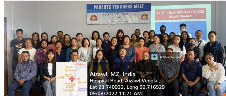
Department of Political Science