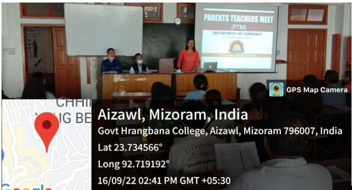
Department of Commerce