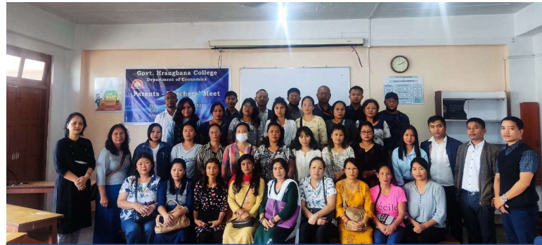
Department of Economics