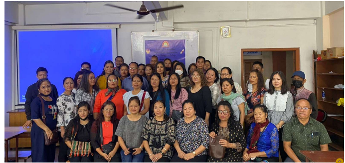
Department of Public Administration