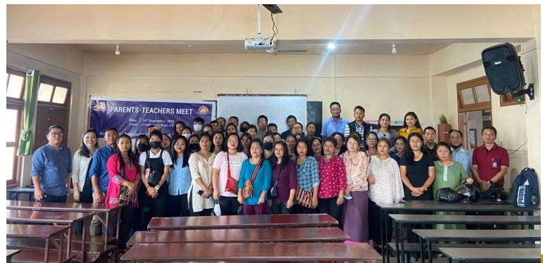
Department of History