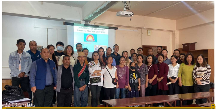
Department of Geography