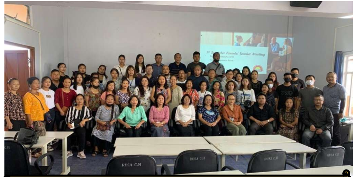
Department of Education