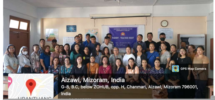
Department of English